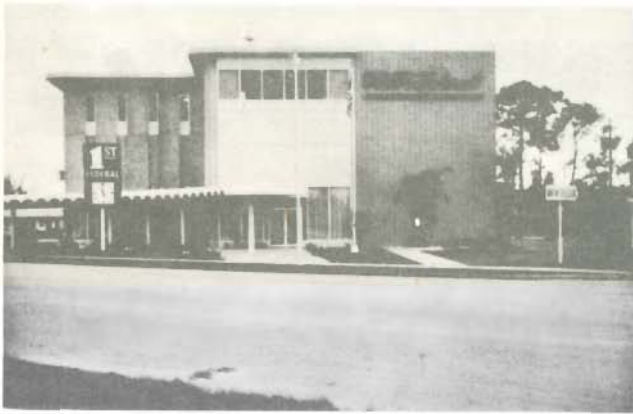
FIRST FEDERAL BUILDING Sarasota, Florida Builder—Rappaport Const. Co. Inc. Mason—Masonry Unlimited, Sarasota